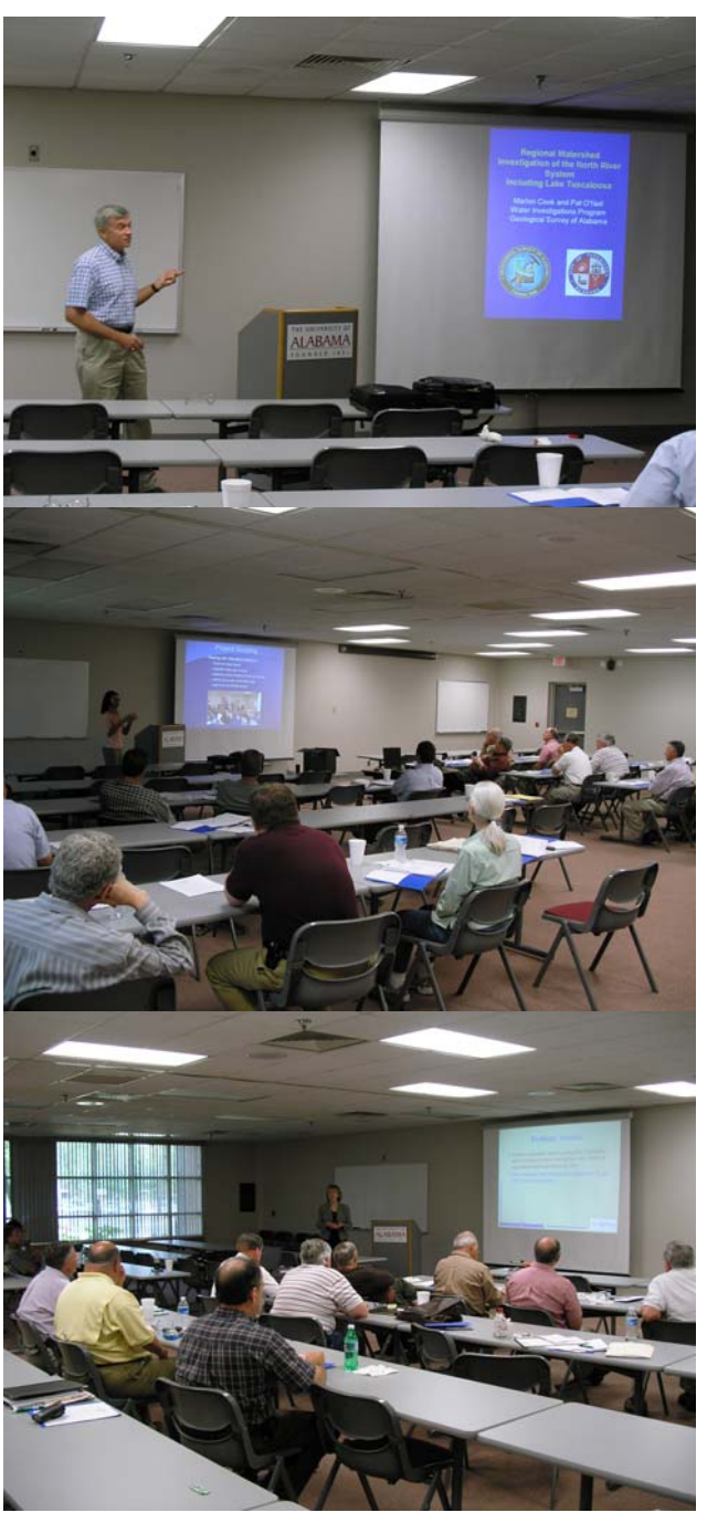
VOLUME 22, NUMBER 3; August, 2009