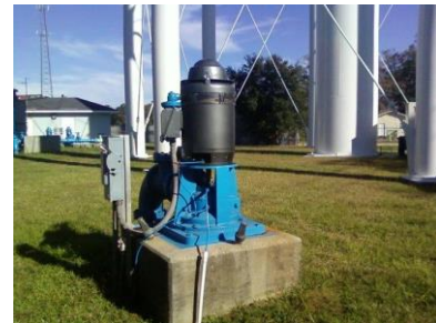
MCW's Boykin Well, 2011

Putting geology to work allowed MCW to maximize their financial resources targeted for groundwater exploration.